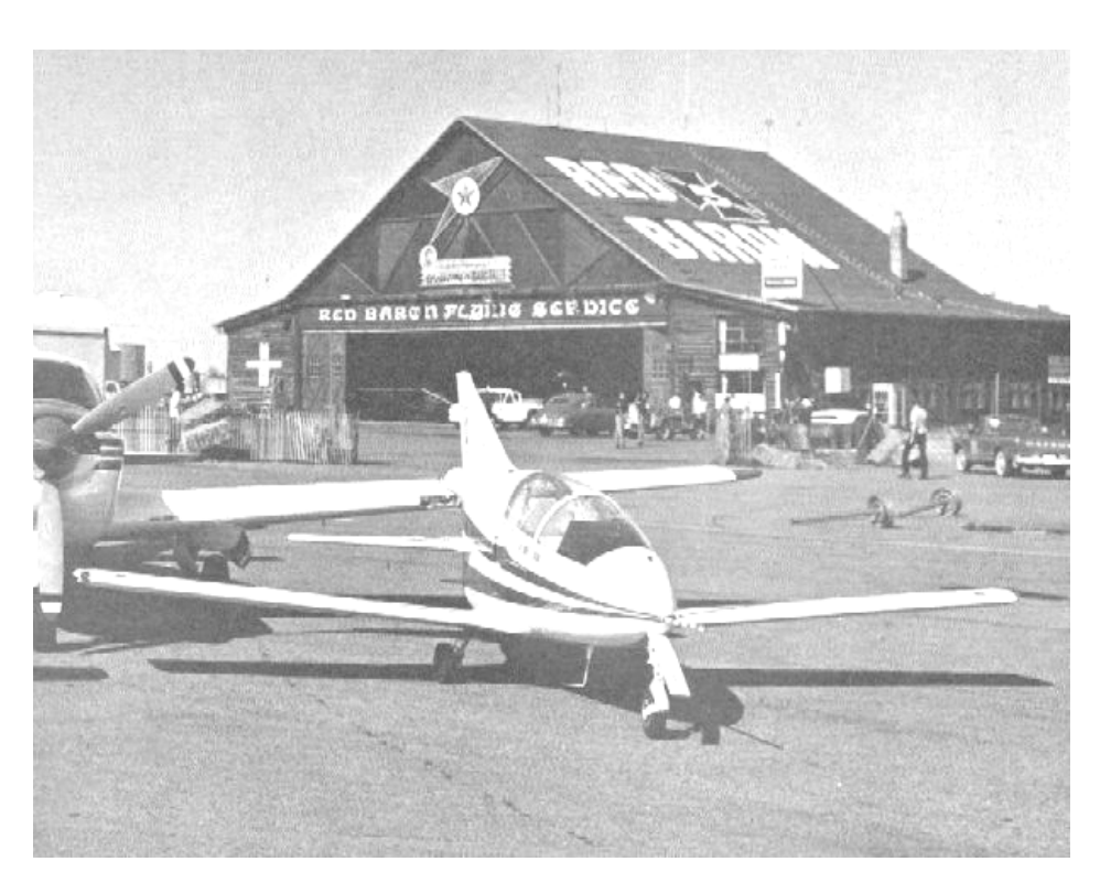
Flashback city... can you guess the date of the picture?