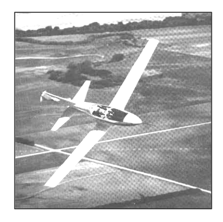
January - March 2000 Issue 23